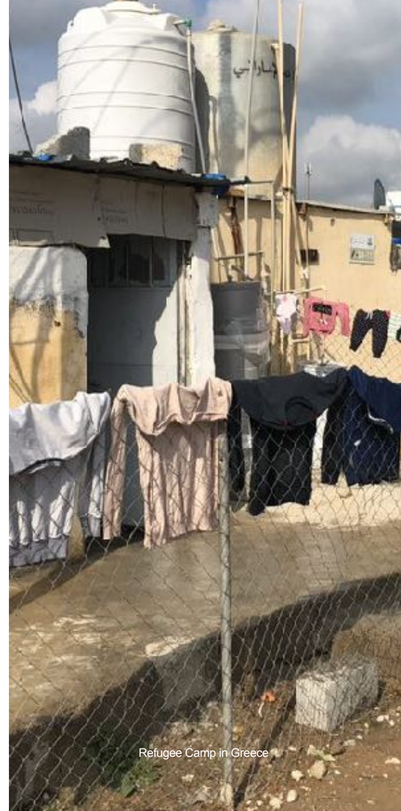
Refugee Camp in Greece

Due to its geopolitical situation, Greece is heavily occupied by refugees. In order to cope with the streams of migrants and asylum seekers, Hellas sets up camps on various islands. Especially Lesbos and Chios become a symbol for the reception of people from Syria, Afghanistan and other eastern countries. One of the main in-country aid organizations is The Smile of the Child, the dominant humanitarian organization in the country. LOG/WoH works closely with The Smile of the Child, bringing children's food, clothing and other essential supplies into the country for distribution - an ongoing project as it shows today.