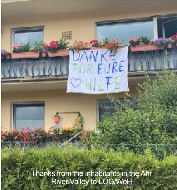
Thanks from the inhabitants in the Ahr River Valley to LOG/WoH