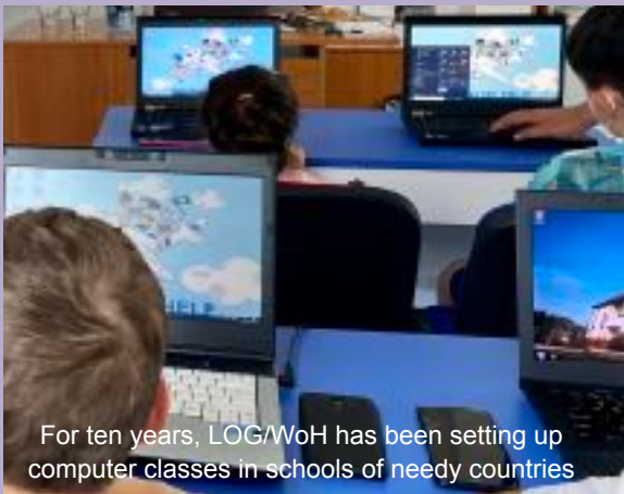
For ten years, LOG/WoH has been setting up computer classes in schools of needy countries