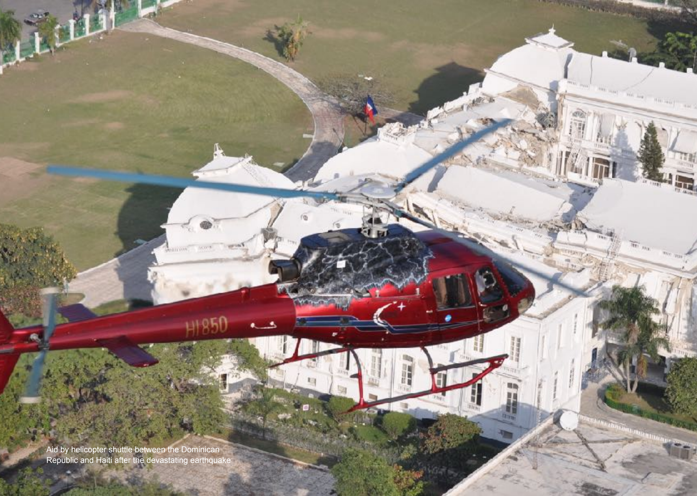
Aid by helicopter shuttle between the Dominican Republic and Haiti after the devastating earthquake