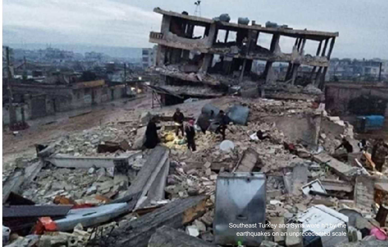
Southeast Turkey and Syria were hit by the earthquakes on an unprecedented scale

The numbers vary widely. At least 60,000 dead, 125,000 injured and three million people affected by destruction - this is the result of several earthquakes in south-east Turkey. Regions like Hatay, Antakya and Gaziantep resemble lands of desolation. LOG/WoH has strong ties to Turkey, knows the border region to Syria and helps with tents, sleeping bags and clothing. LOG/WoH knows: This task of standing by the people with help and hope will take many years.