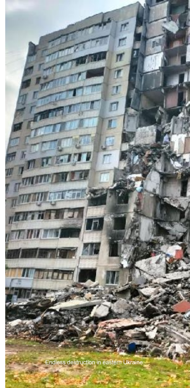
Endless destruction in eastern Ukraine

The war in Ukraine challenges LOG/WoH in a special way. Convoys of more than 70 trucks are bringing thousands of tons of relief supplies to those in need in Ukraine and in emergency shelter camps along the Ukrainian-Romanian border. A large-scale operation with which LOG/WoH provides people with food, drinking water, clothing, hygiene products, blankets and much more. The willingness to donate in Germany is consistently strong. LOG/WoH continues the transports.