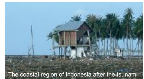
The coastal region of Indonesia after the tsunami

The 9.1 magnitude Indian Ocean earthquake with its epicenter 85km off the north-west coast of the Indonesian islands was the third-strongest on record and triggered a series of devastating tsunamis along the Indian Ocean coasts. In total, around 230,000 people died as a result of the earthquake and its aftermath. The tsunamis were the deadliest of all time. Over 1.7 million coastal residents around the Indian Ocean were left homeless. Around 165,000 people died in Indonesia alone, and tens of thousands more in Sri Lanka, India and Thailand. LOG/WoH used an airlift to fly urgently needed relief supplies (clothing, tents, pharmaceutical products, etc.) to the region, with a focus on the devastated Indonesian province of Banda Aceh on the northern tip of Sumatra.