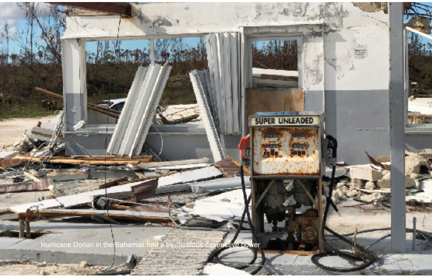
Hurricane Dorian in the Bahamas had a tremendous destructive power

Cyclone Kenneth destroyed the livelihoods of more than 100,000 fishermen and farmers to an unimaginable extent. Boats, nets and farm land are victims of the cyclone, which drove the sea water ever more inland. LOG/WoH decides to provide immediate aid with clothing, builds a computer school in a small town near the capital and brings drugs against cholera into the country, saving the lives of over 20,000 people, according to the Mozambique Red Cross. The partner Aviation sans Frontieres, Belgium was also involved in this campaign.