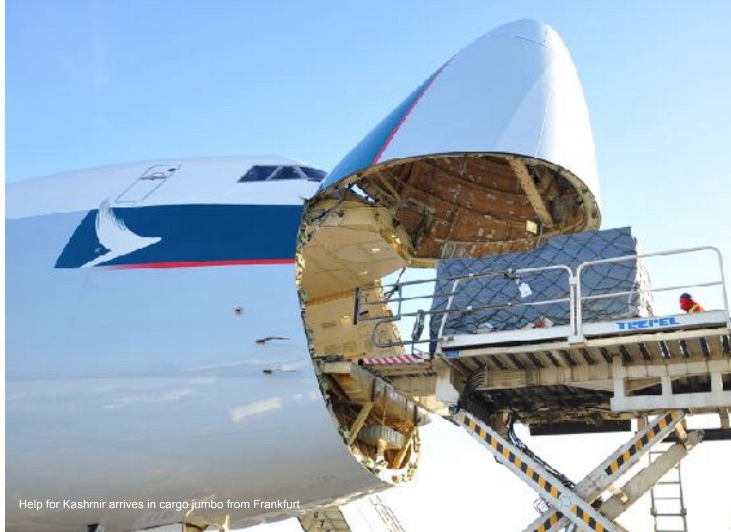
Help for Kashmir arrives in cargo jumbo from Frankfurt

Hurricane Katrina in the Gulf of Mexico particularly hit the American south with the city of New Orleans. Among the helpers from Europe: LOG/WoH. In cooperation with EADS/Airbus, the organization brought a mobile rescue station to the "Deep South", where 1,800 people had already died as a result of the hurricane. The facility became a major medical supply station in the New Orleans city limits.