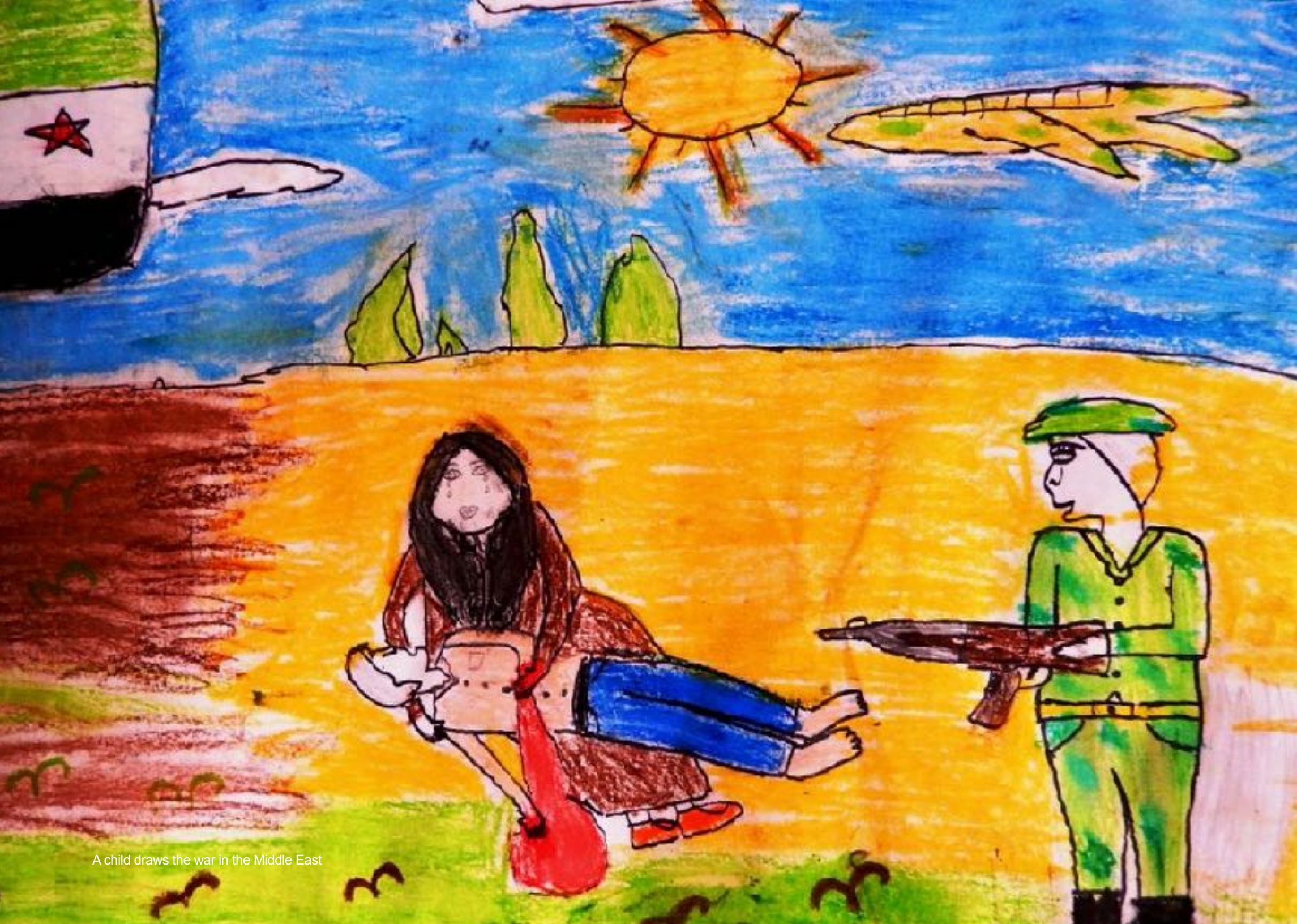
A child draws the war in the Middle East