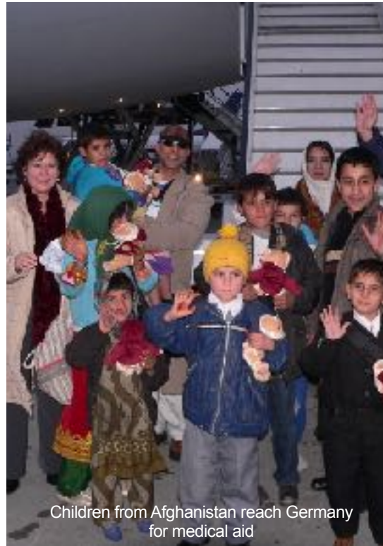
Children from Afghanistan reach Germany for medical aid

+++ SARS pandemic afflicts the world: 770 deaths +++ Heat wave in Europe causes 20,000 deaths, 700 victims in Germany alone, record temperature of 47.5 degrees Celsius, 500 hours of sun more than usual +++ More than 700 elementary events and natural disasters, including more than 70 earthquakes worldwide, 6 billion US dollars in earthquake damage alone +++ Earthquake in Iran with 26,000 victims +++ Ongoing fight against the 15 billion euro damage caused by the floods in Central Europe in 2002 +++ January 2003: In Paris First talks on founding Luftfahrt ohne Grenzen/Wings of Help (LOG/WoH) together with EADS/Airbus. June 3, 2003: Official founding of LOG/WoH in Frankfurt am Main as a registered association.